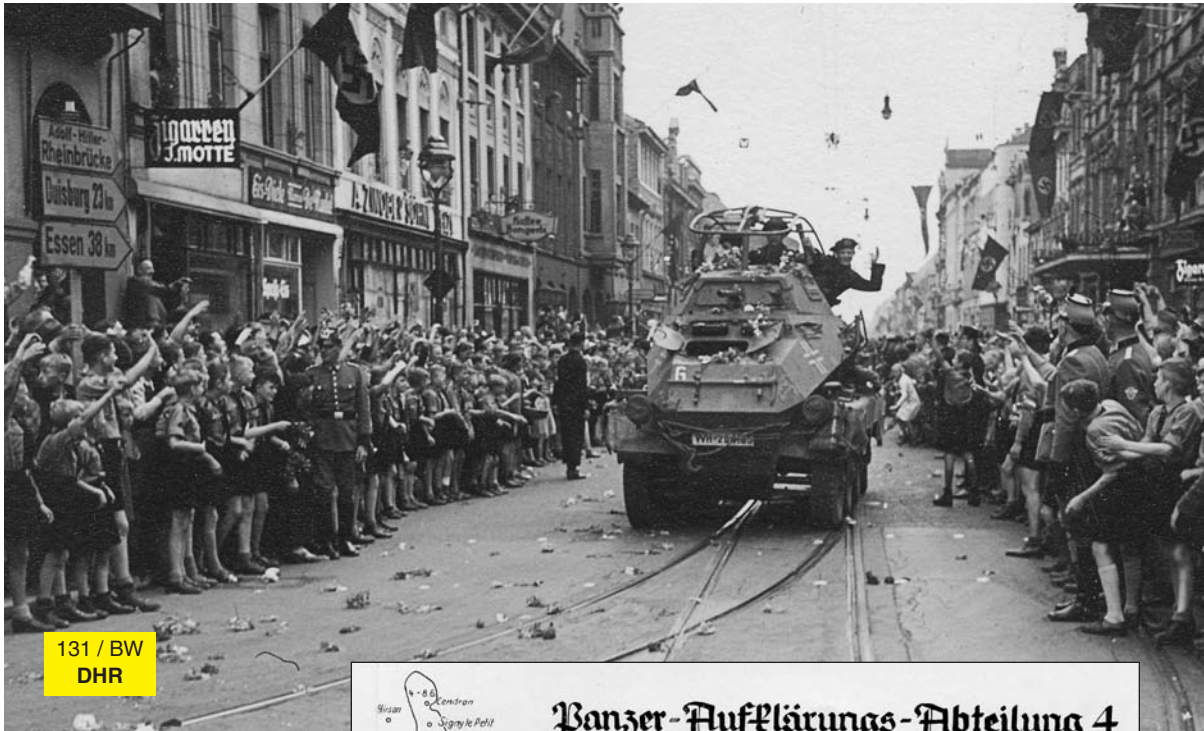
131 / BW DHR

Once the troops came home, there were innumerable welcoming parades in front of enthusiastic throngs.